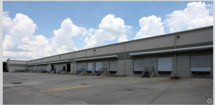
Pro Sports Group Facility - Jacksonville, FL, USA

AT PRO SPORTS GROUP, SERVICE IS A PRIORITY. PLEASE CALL US TOLL FREE AT 866-883-6265 OR E-MAIL US AT ORDERS@PROSPORTSPADS.COM .